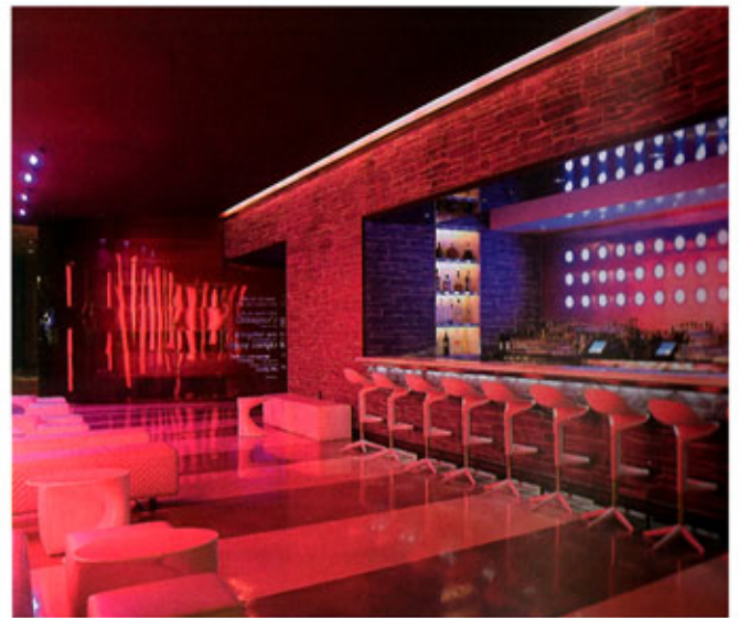
TOP: THE SMALLER CAPACITY ABBEY ROAD BAR FORMS THE ENTRANCE TO THE LARGER REVOLUTION LOUNGE. BOTTOM: BEHIND THE BAR IN THE HALLWAY THE LCD SCREEN PORTHOLES ARE A REFERENCE TO 'YELLOW SUBMARINE'.